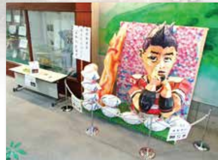
Seki City Combined Gymnasium Rugby Support Corner

In 2016 a Buddhist statue posing in the likeness of Goromaru in Seki City's Zenko-ji Temple gained national attention. Since then floats in the image of Goromaru Ayumu have been enjoyed by the spectators who see them. From this we can know that Seki City has a deep connection with rugby.